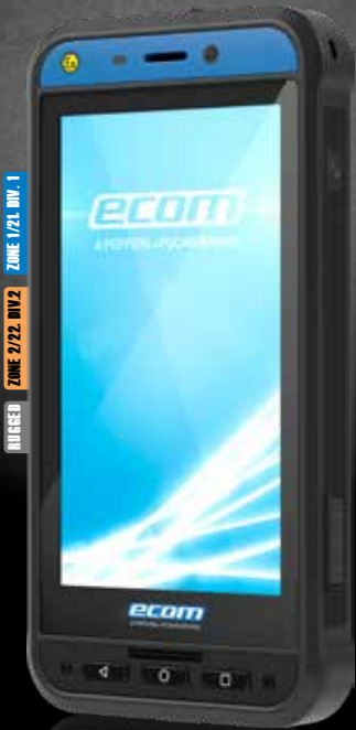
Intrinsically safe smartphone Smart Ex® 02

QUICK START GUIDE FOR GLOBAL HAZARDOUS AREAS